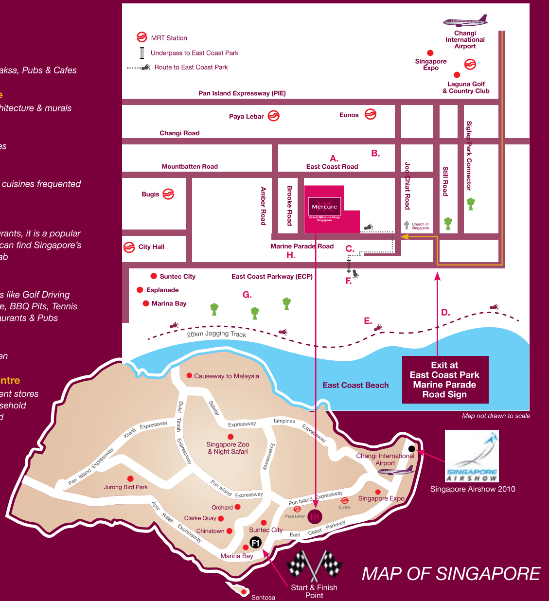
MAP OF SINGAPORE

Over 250 specialty shops & department stores with international brands & local household names from apparels to music & food