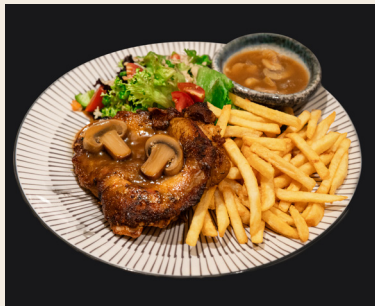
Golden Chicken Chop $18.00

Wok-fried rice, premium beef steak, sunny side-up egg, broccoli