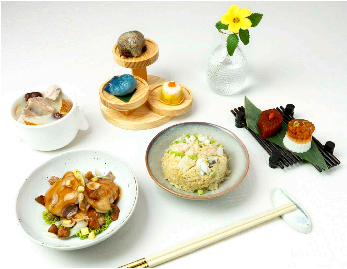
SME04 精致午餐套餐 Elegant Lunch Set Menu