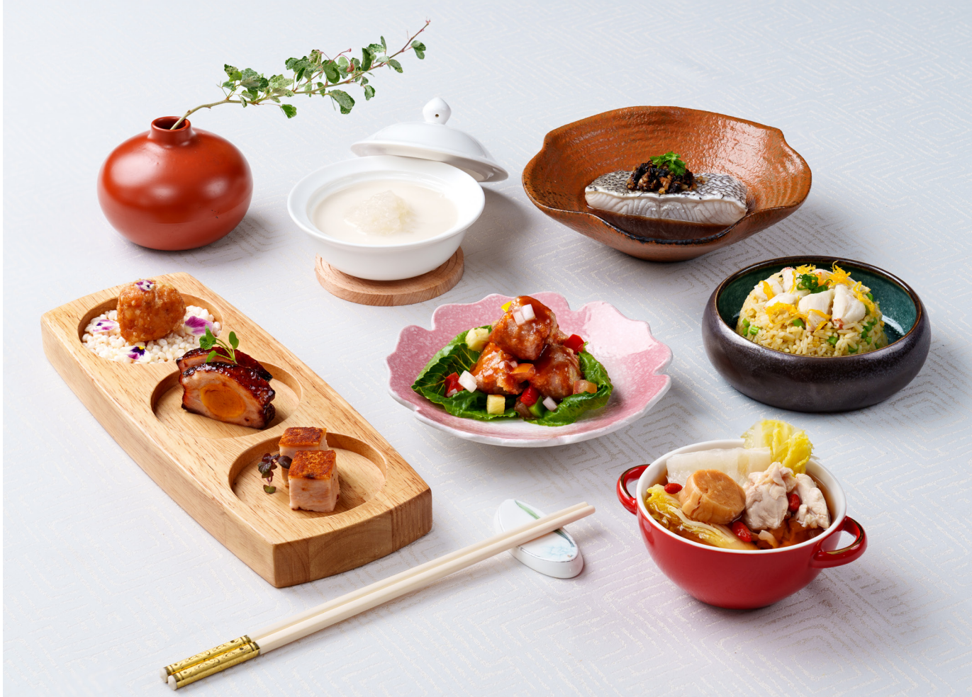
SME04 桂花黄金套餐 Golden Treasure Dinner