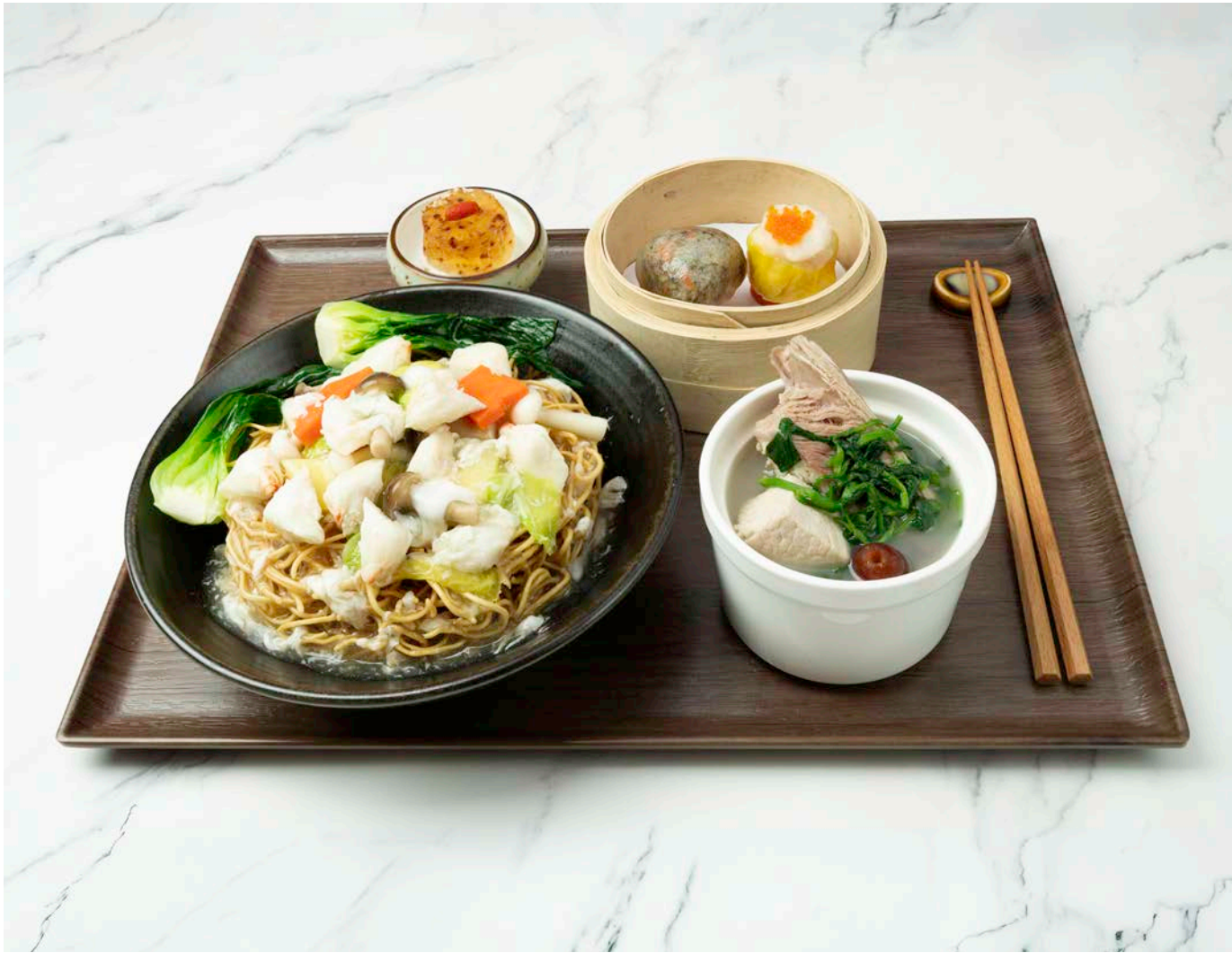
SME03 蟹舞金丝午间赏味 Crispy Golden Noodle Set