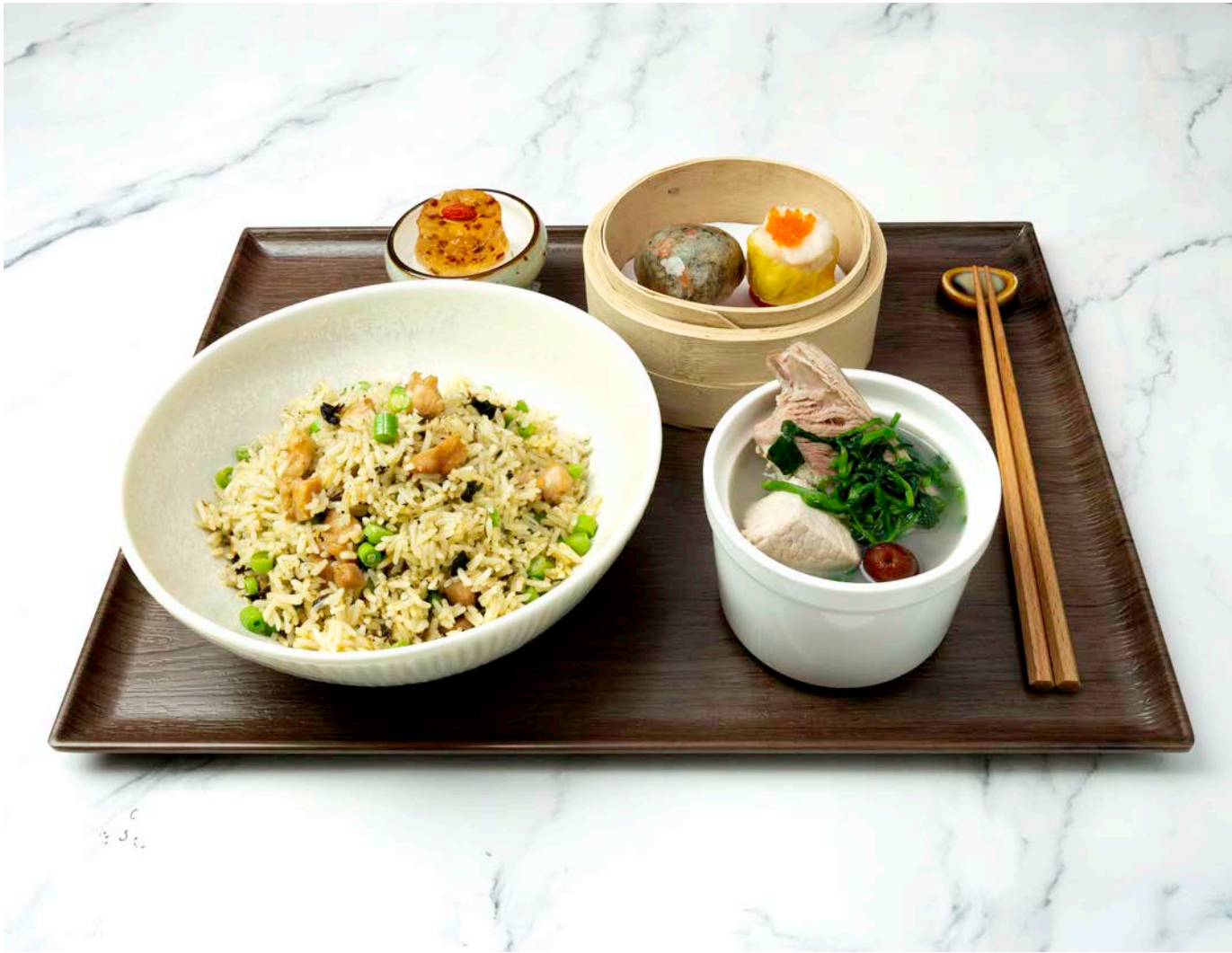
SME02 锅气票风香，午间珍饈 Smoky Wok Hei Set