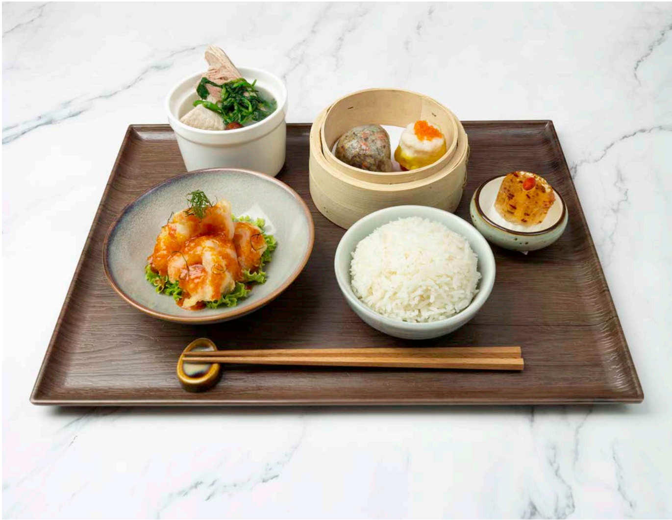
SME01 青柠沁虾午间习住食 Zesty Lime Prawn Set