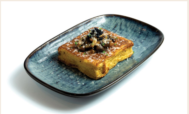
Mushroom French Toast (SF)

Grilled chicken breast, creamy mushroom, lettuce, buttered croissant